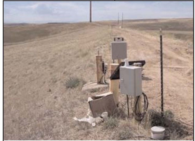
Groundwater monitoring wells such as these will continue operation for many years to come.

The first position was to set a goal of cleanup to background levels of contamination when and if technology allows for that to happen. As discussed earlier, the establishment of appropriate cleanup levels for Rocky Flats was a major concern for the Board and the community surrounding the site. Because environmental cleanup standards evolve over time, often in a downward direction, the Board maintained that cleanup to background should be a goal, even as the members realized that current technology would not allow that to happen. The members viewed the established cleanup levels set as being interim in nature and advised that continued research should be conducted to see if one day the cleanup to background goal could be attained. This was one area in which the Board was never able to get agreement from the Department of Energy and the regulators.