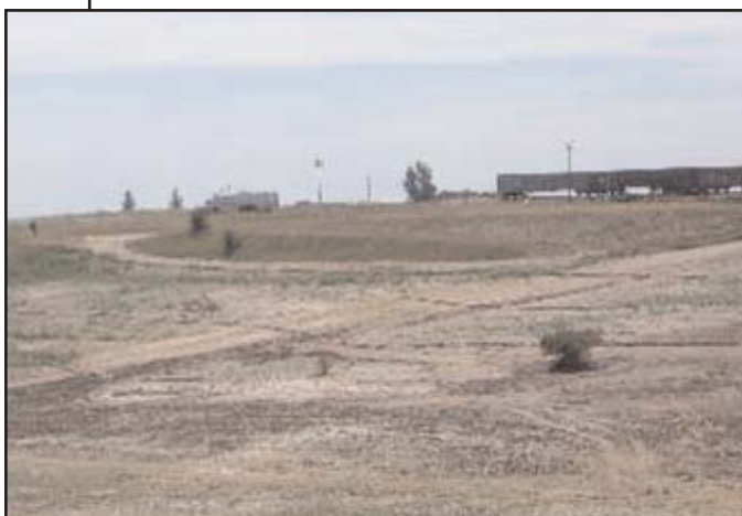
This photo was taken after the demolition of Building 771 was complete.

During the next couple of years, there were two major activities at the site. The first and predominant focus was to upgrade facilities and write new procedures so that nuclear weapons production could restart. A secondary focus was to begin addressing the environmental issues responsible for the site's listing on Superfund. The environmental activities were mainly studies to identify areas of contamination, followed by development of plans to address what was found.