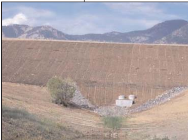
A large earthen cap was constructed over the Present Landfill at Rocky Flats.

Neither the Department of Energy (DOE) nor the regulatory agencies accepted this revised number and instead began another round of reassessment of the cleanup levels. DOE and the agencies established a community focus group on which members of the Citizens Advisory Board participated. After another two years of discussion, DOE and the agencies established a final soil cleanup standard for plutonium set at 50 picocuries per gram.