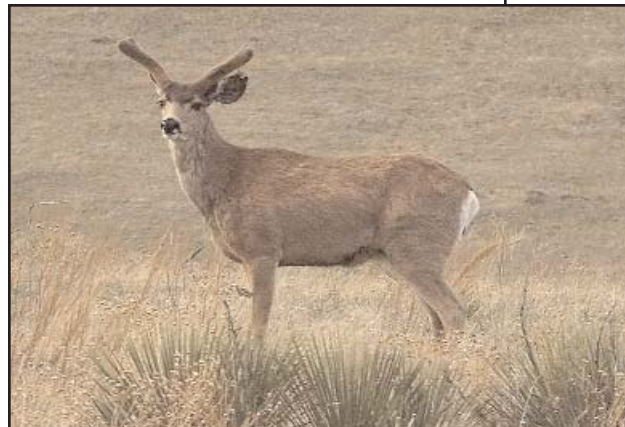
Deer have always been found at Rocky Flats. For the first time in 50 years, they now outnumber humans at the site.

with some public access. Future public activities will include hiking, biking, and horseback riding along designated trails. There also will be limited hunting allowed in special programs for youth and the disabled. For the first five years, Fish and Wildlife plans to do mostly ecological restoration. One public trail may be opened during that time, but most public access will be limited for the first five years.