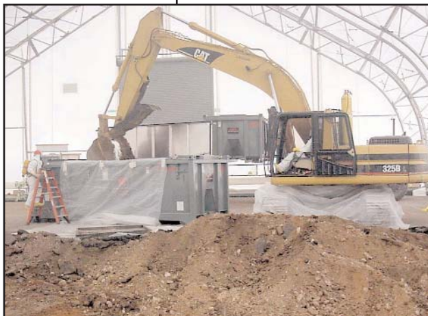
Cleanup of the 903 Pad was done inside a large tent structure.

department and EPA representatives selected an initial group of six individuals representing a broad cross-section of the community including local governments, community groups and site workers.