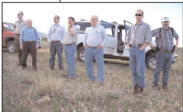
Members of the Board made their "final inspection" of Rocky Flats in May 2006.

Another position for the Board was that no wastes should be permanently disposed at Rocky Flats. In the early days of the cleanup, there was concern that receiver sites for the wastes generated