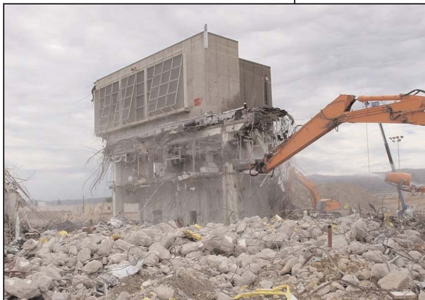
The last of the former plutonium facilities to be demolished was Building 371. The photo shows the final stages of demolition in 2005.

Another cleanup challenge would be the decontamination and demolition of more than 800 buildings and structures at Rocky Flats. Within many of the buildings were miles of pipes and ventilation systems, hundreds of gloveboxes, and very large and heavy pieces of equipment. Much of the infrastructure within the