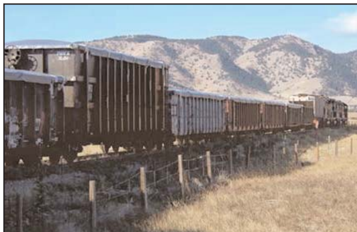
This is the final rail shipment of low level nuclear waste that left the site in the fall of 2005.

The most infamous environmental site was the 903 Pad where waste drums containing a mixture of machining oil, organic solvents, and plutonium metal shavings were stored. Materials from these drums eventually leaked into the adjacent soil. An earlier remediation project had removed the drums and scooped up the contaminated soil. Unfortunately, strong winds arose during the process of removing the contaminated soil, causing it to spread to both on and offsite areas. In the early 1970s, an asphalt cap was installed over the main drum storage area. Final cleanup of this site would require removing the asphalt and underlying soil as well as any contaminated soil spread to adjacent areas.